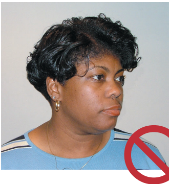
Old Three-Quarter Style Photo